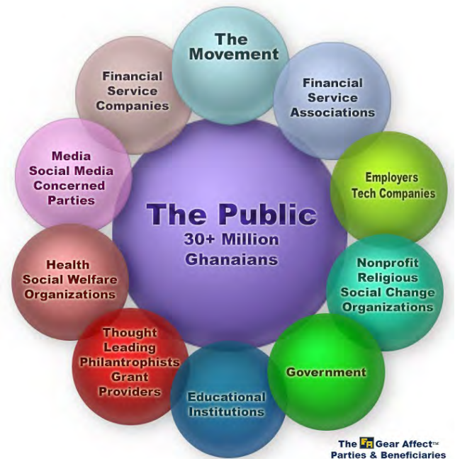
The Gear Affect™ Parties & Beneficiaries

Together these organizations and their leaders represents a direct communication channel to all Ghanaians. Further, they have a vested interest in helping to raise the quality of life for all Ghanaians, as it will also improve their businesses, and allow them to do their jobs more effectively.